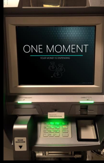
Money is counted from a collection of known available bills and coins. If a bill or coin runs out, the system will use other bills/coins to fulfill the request.