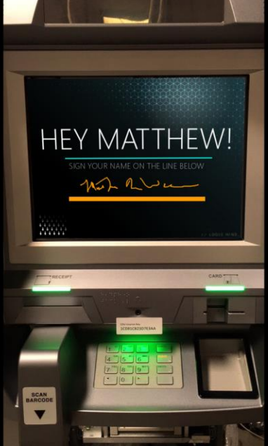
The pin number is validated, the customer is confirmed and the customer signs their name on the signature pad to accept payment. The camera at the top of the unit captures a picture of the customers face.