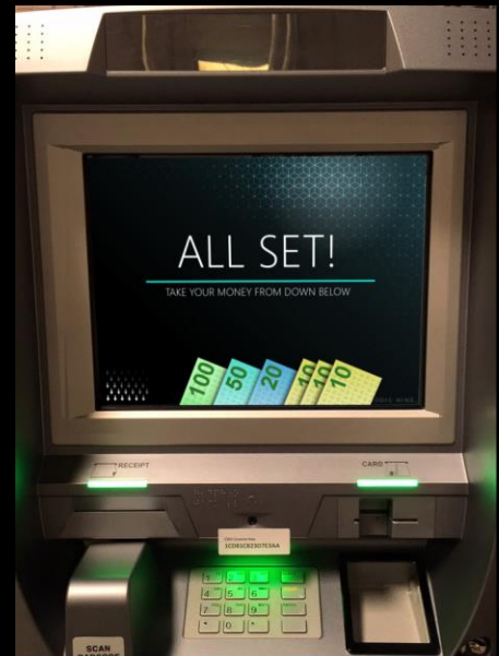
A visual aid is shown on screen representing the bills and coins that were dispensed to the customer.