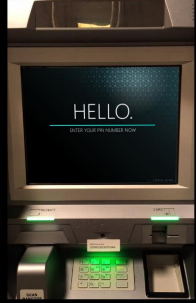
The machine resets and is ready for the next customer.