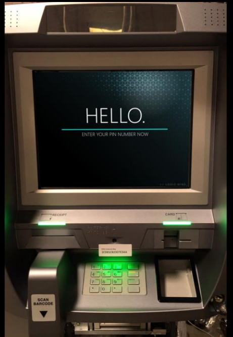
The machine waits until a customer approaches and enters a pin number.