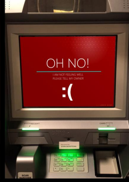
Should anything abnormal occur, the machine will lock itself and make it known it is not working. It will also send a text message to any and all staff which can assist and will offer detailed responses on what occurred (most often, when it is out of money).